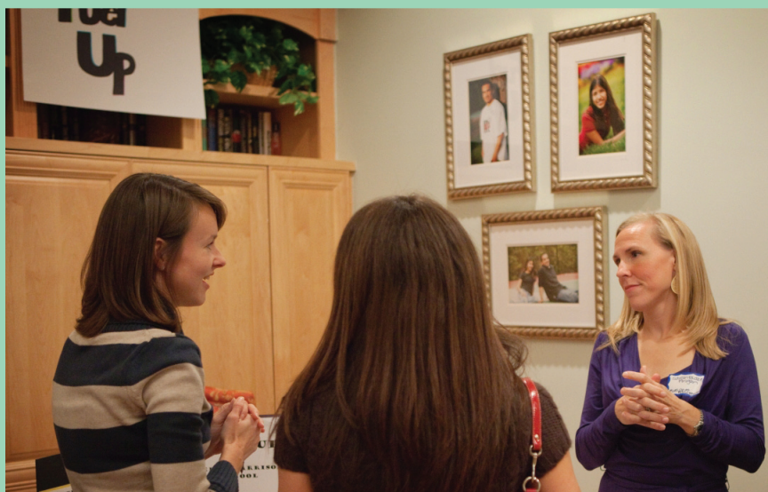
Chapel Hill Giving Party 2009