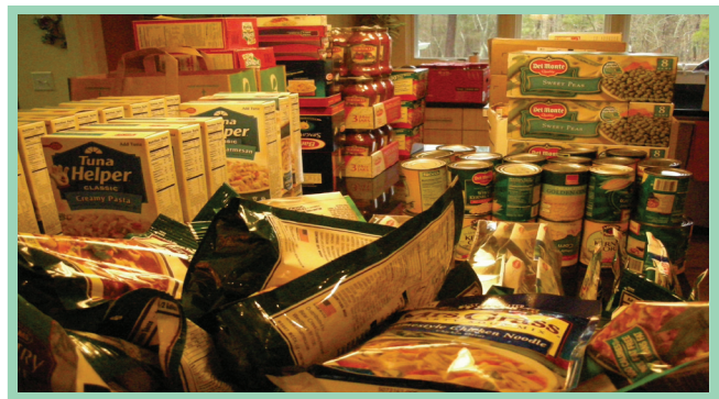
Packing for school holiday

One weekend = $15 One month = $60 One quarter = $125 One semester = $250 One school year = $500